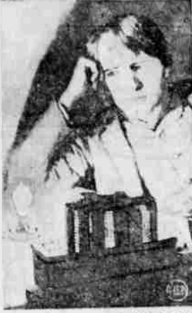
Edison's constant vigil in 1879. At last, one light was made that burned over 1,500 hours.