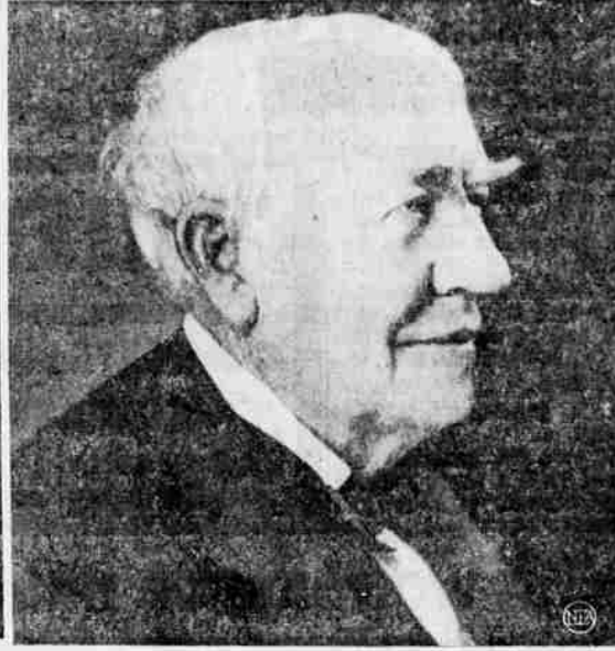
Thomas Alva Edison, "The Wizard of Menlo Park," near the end of his career. He died in 1931 at the age of 84. Today, millions of people in many industries owe their jobs to him.