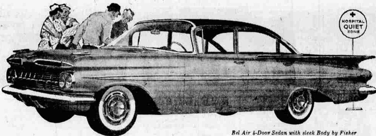
Bel Air 4-Door Sedan with sleek Body by Fisher