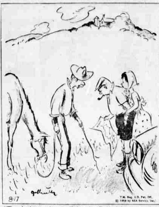
"The Jackson place? Take the first right turn, then jog left. You'll see my cousin Claud sitting on a fence and he knows everything!"

Want Something Delivered or Moved? Phone TU 2-3737 CITY DELIVERY SERVICE