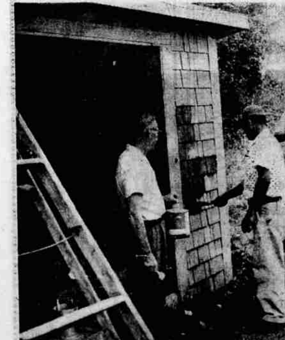
SCHOOL BUS SHELTERS are being readied for the term opening by Weed Lions Club members. Original building of three shelters was a Lions Club project several years ago. A fourth was built by a neighborhood group and placed at Fourth and Walnut and is being maintained by the club. Over 300 Weed students ride the bus and make use of the shelters.

NEW YORK (AP) — Curtiss-Wright Corp. today said it will produce cars which travel on air. A company spokesman said production at its South Bend, Ind., plant would start in November but the rate had not been set.