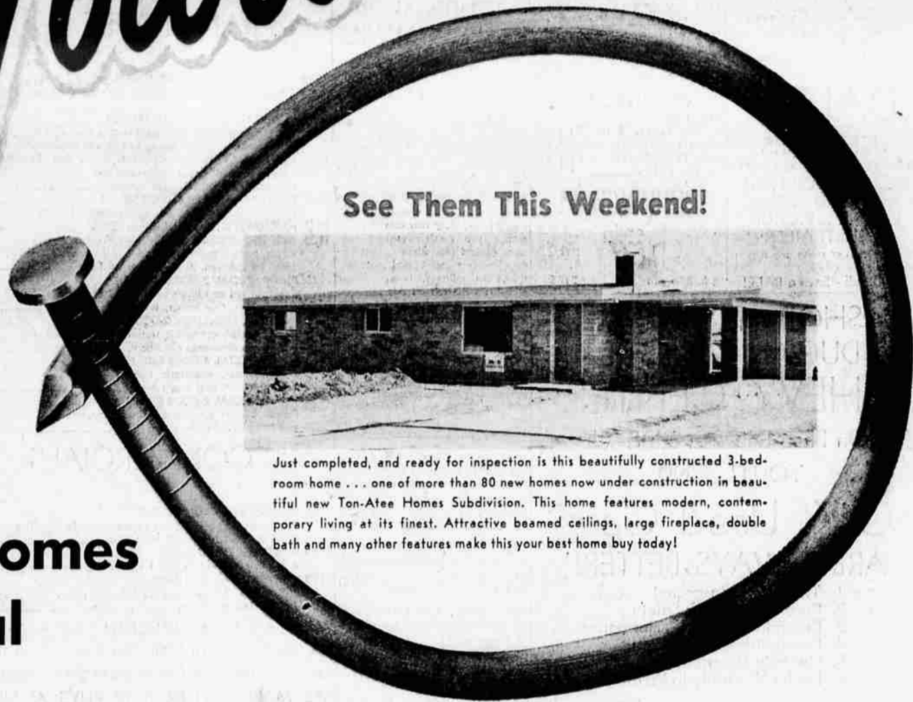
See Them This Weekend!

80 new 3-bedroom homes in Klamath's beautiful new sub-division . . . . .