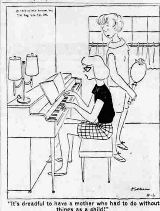
"It's dreadful to have a mother who had to do without things as a child!"