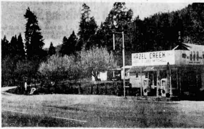
HAZEL CREEK STATION, 10 miles south of Dunsmuir, was the site of an early-day hotel and coach stop connecting California and Oregon settlements. It will soon be demolished to make room for the last part of the freeway being built near Dunsmuir. The picture plainly shows the ancient cherry trees extolled by Mark Twain who stopped at the hotel when he was traveling with Gen. U. S. Grant.