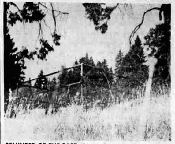
REMINDER OF THE PAST, this small cemetery by the freeway near Hazel Creek Station, 10 miles south of Dunsmuir, contains the bodies of two residents of the area who died there around the turn of the century.