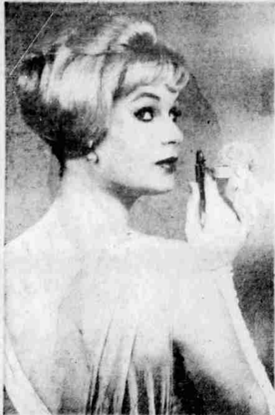
SUMMER'S newest and most exciting accessory is the Hi-Society oval-mirror lipstick case and Max Factor is now introducing these cases in four summer pastels which are beautifully keyed to the new "all-over-look-of-color" in fashion.