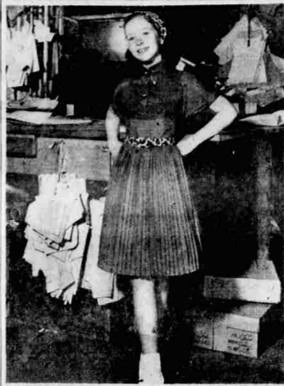
THIS PRETTY MISS never misses. Her charming but practical dress is made with jersey of 100 per cent Acrilan acrylic fiber by Chemstrand. She is shown in the pattern and cutting rooms of one of the country's largest children's wear manufacturers where she is finding out how easy care dresses like her own are made. The dress is drip dry and needs only touch-up ironing to look newer than new. The dress carries a Montgomery Ward label.

Want Something Delivered or Moved? Phone TU 2-3737 CITY DELIVERY SERVICE