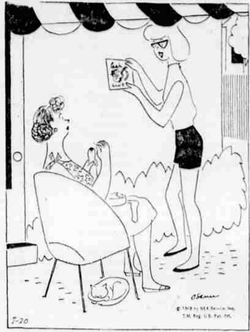
"I bought the most marvelous record. Father will positively loathe it!"