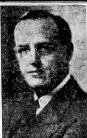
HON. WALTER H. JUDD