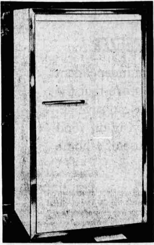
THE SMALLER FAMILY of three or four usually find a 12-15 cubic foot freezer the best buy. This size is a good starter size for larger families. It fits in well where there is a shortage of floor space . . . has plenty of room to hold all the good seasonal buys on meats and produce.

until firm. Store in moisture-proof, vapor-proof bags. To serve, arrange in your biggest glass bowl or brandy snifter (chill server first), and let stand in refrigerator to soften slightly. Drizzle with Cranberry Sauce (see below) and top with a sprig of mint. Delicious cooling on a summer day. CRANBERRY SAUCE Combine one pint cranberry juice with two tablespoons cornstarch. Cook until thick and clear. Remove from heat. Add 1 teaspoon butter and a few drops of red food coloring. Chill well. The homemaker with a hankering to serve something different has a wide field in her home food freezer.