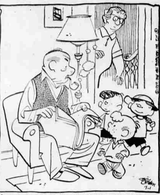
* DENNIS TOLD US TO MEET HIM HERE. OKAY? *