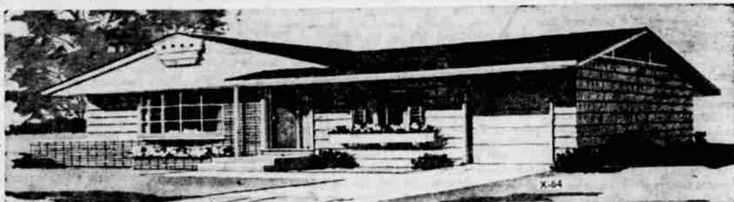
RANCH WITH A DIFFERENCE: This seven-room home is arranged in an "L" shape, with family room and garage helping provide a wide front elevation. The home offers 1,481 square feet of habitable space and 1½ baths.

The living room offers a formal entertainment space 13 feet deep by nearly 24 feet wide. A big bow window lets in the light on the front wall. A long section of unbroken wall on the left makes furniture arrangement easy. The dining room adds to the illusion of space in the living room and is directly off the kitchen.