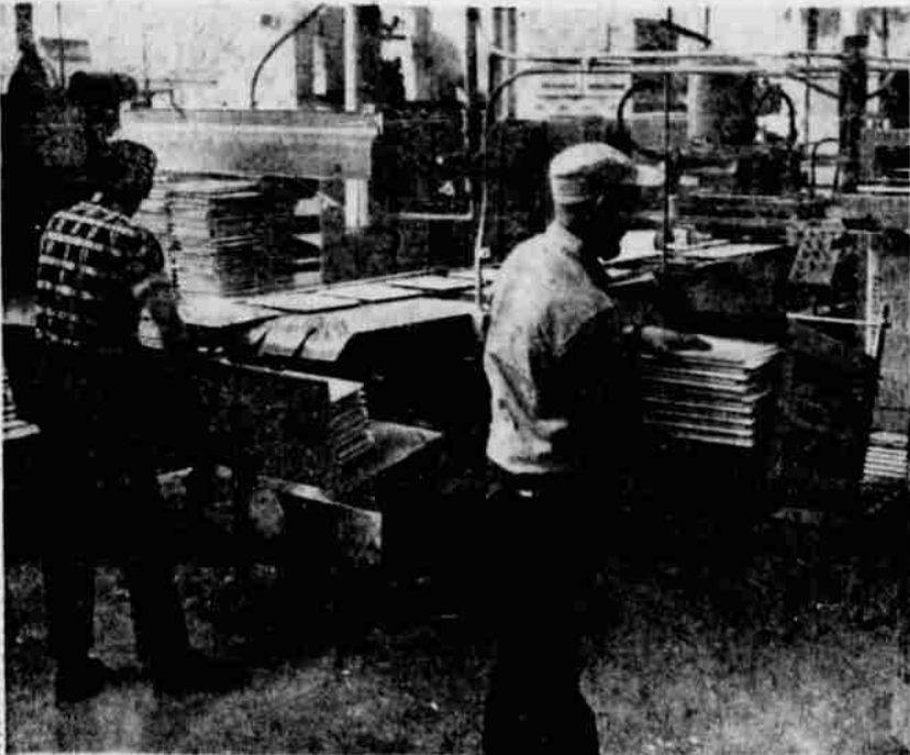
TWO EMPLOYEES of the Johns-Manville plant are busy engaged packing tile from the new insulating board plant near Klamath Falls.