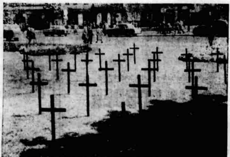
GRAVE WARNING —This is not a cemetery, but a lawn in Augsburg, West Germany, which is intended to give a grim picture of traffic accidents. Each cross represents a traffic death during the past year in the town, but how much good they do isn't known.