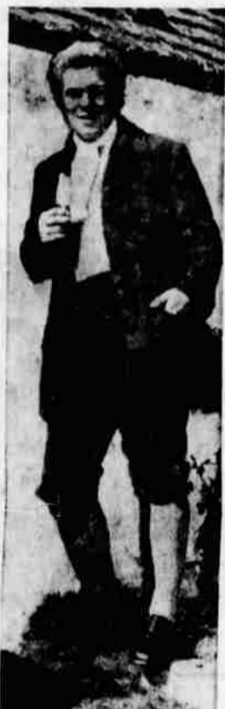
BETWEEN SCENES —Actor James MacArthur may be dressed in old-time Scottish clothes, but he's keeping cool with ice cream in Ballachulish, Scotland. The son of actress Helen Hayes was relaxing between scenes for Robert Louis Stevenson's "Kidnapped," being filmed over there.