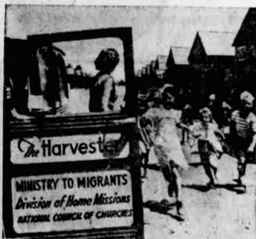
EXCITING EVENT —Some children at a remote migrant camp in the state of Washington are greeting a "harvester" station wagon. The Migrant Ministry of the National Council of Churches operates a fleet of 38 of these station wagons throughout the country. They bring worship, play and educational material to camps of people who follow harvests.