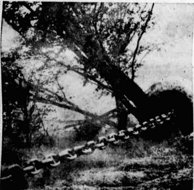
CLEARING THING UP —One of several 8-foot steel balls, linked together with heavy chains, has toppled a birch tree like a totem at Kariba, Rhodesia. The balls are towed through the brush in a project to clear some 100,000 acres. The area will be the fishing grounds and harbors of the giant lake which will form behind the Kariba Dam.