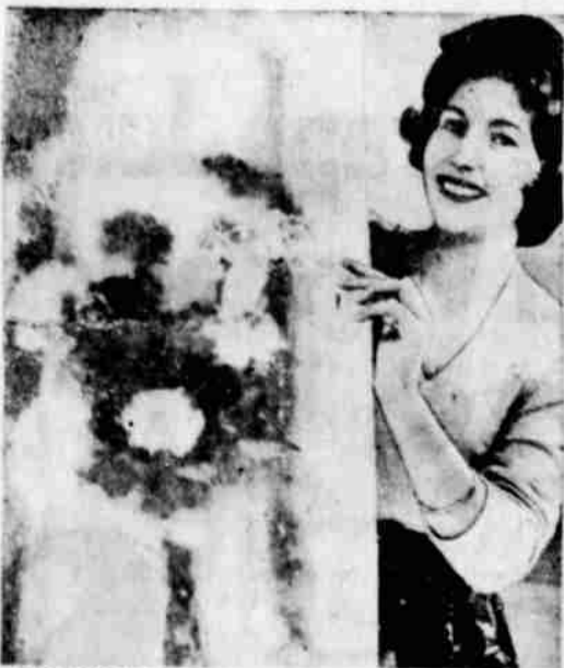
WELL PRESERVED —A pretty miss in Paris is admiring some carnations from the French Riviera. They were packed in ice to preserve their freshness and displayed at a press conference where they were used to help promote a bigger international trade in flowers.