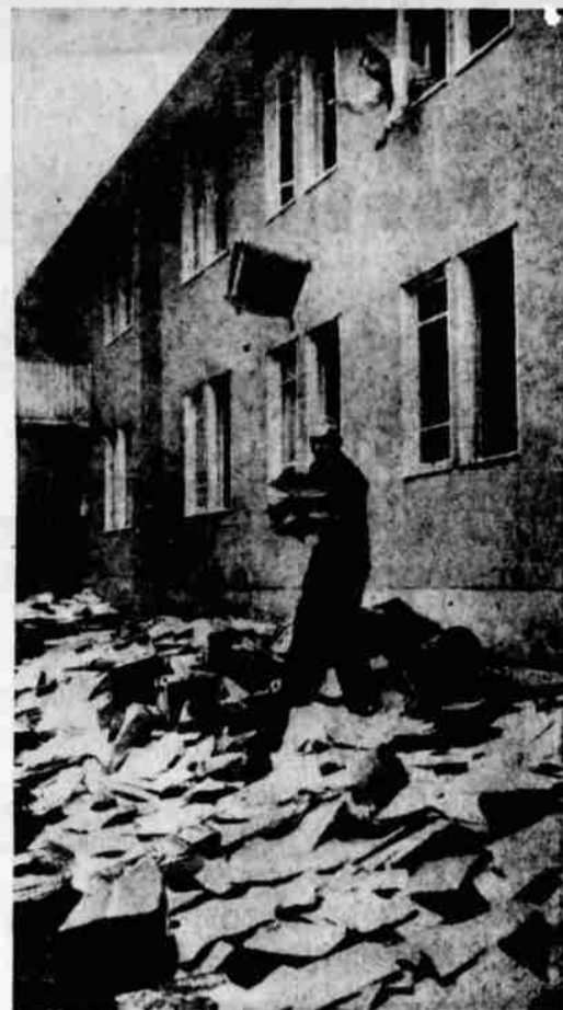
ALL BUT THE KITCHEN SINK —And it, too, could have been thrown from a window of the press headquarters when it caught fire in Bonn, Germany. As one man tosses a chair from an upstairs window, an unidentified correspondent stands amid stacks of paper littering the lawn. Police, correspondents and others braved smoke and flames to try and save office equipment and new files. The fire broke out while most of the Bonn correspondents were away on weekend.