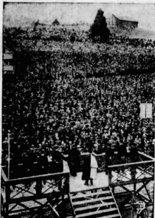
DEMOCRACY IN ACTION —About 9,000 men are gathered in the open air parliament of Hundwil, Switzerland. They were there to vote on legislation and elect leaders in a traditional form of government "by the people." Members of the acting government presided from the stage in foreground, as they still do in rural areas of Switzerland like this.