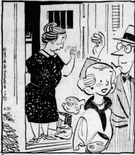
"I'LL BET YOU CAN'T FIND YOUR PURSE!"