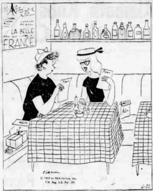
"Could we risk my French?"

"I guess we'll just have to start over," he told a relative.