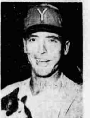
YAKIMA BOSS Hub Kittle Night-mare