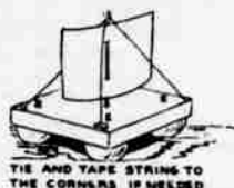
TIE AND TAPE STRING TO THE CORNERS IF NEEDED