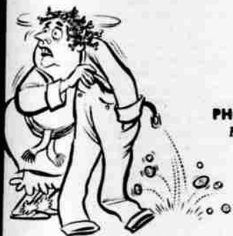
PHONOPHOBIA Fear of noise