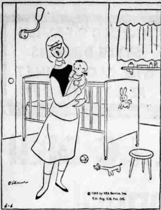
"Rock-a-bye, baby, cha-cha-cha—!"