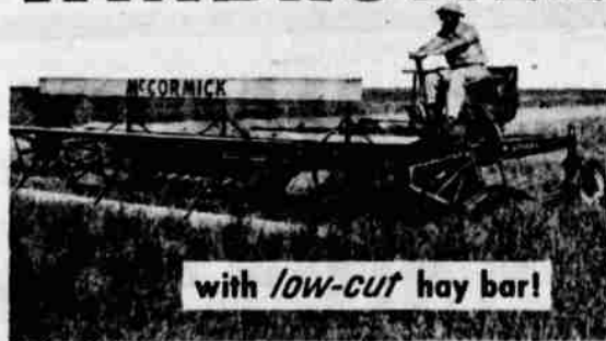
with low-cut hay bar!

Windrow heaviest hay in any field condition