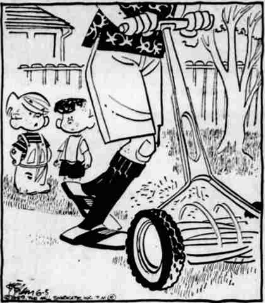
"HE PUTS STUFF ON IT TO MAKE IT GROW, AN THEN HE WONT LET IT!"