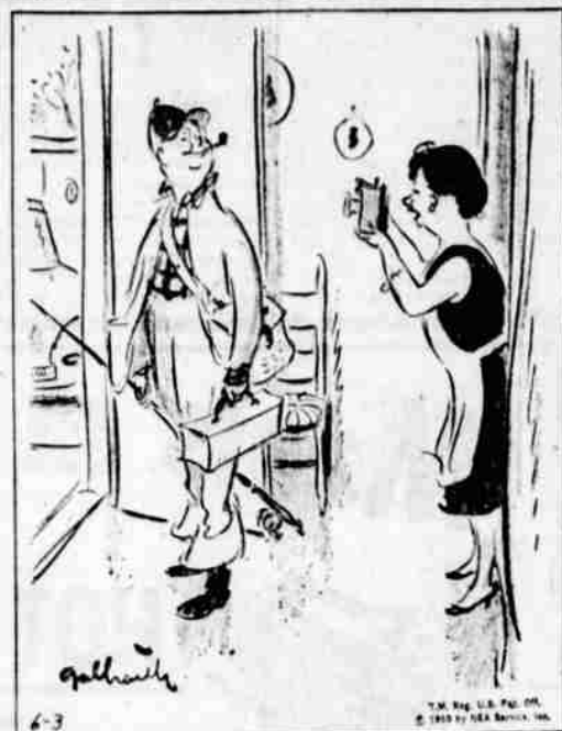
"Wait just a minute, dear—I want to capture that look of beaming confidence on your face!"