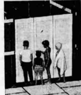
LOCKED OUT! The self-locking door of the Living Pool provides maximum safety—it keeps children and pets from wandering in when the pool is not in use. A sturdy fence with attractive aqua-colored weather cloth is an integral part of the new pool—providing safety as well as privacy.