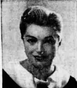
Esther Williams, glamorous President of International Swimming Pool Corporation and world-famous authority on swimming pools... as she appeared at a recent distributor conference.