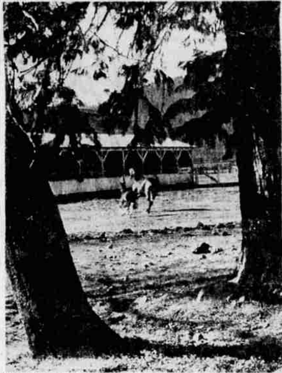
MOTHER AND SON romp across the lush bluegrass pastures with one of the barns in the background. Blood lines of such racing stars as Man O' War, Citation, Seabiscuit, Equipoise and Swaps can be traced in those romping colts.