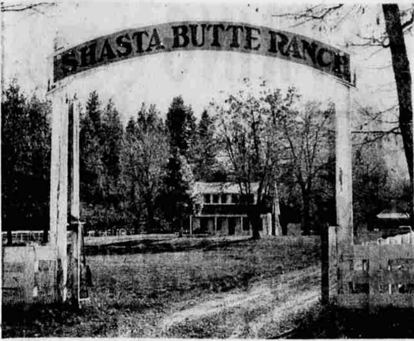
ENTRANCE to a typical Kentucky ranch is marked by this overhead sign. William L. Douglass is current owner of this Kentucky-styled horse ranch located two miles northwest of Mount Shasta.