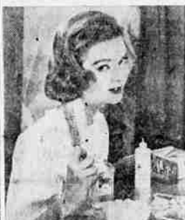
NEW TONI kit features a no-mix liquid creme neutralizer in a small plastic applicator bottle, adding to the convenience of your Toni home permanent.

For your next permanent wave, and it should be marked on your beauty calendar now, try the new Toni kit with no-mix neutralizer.