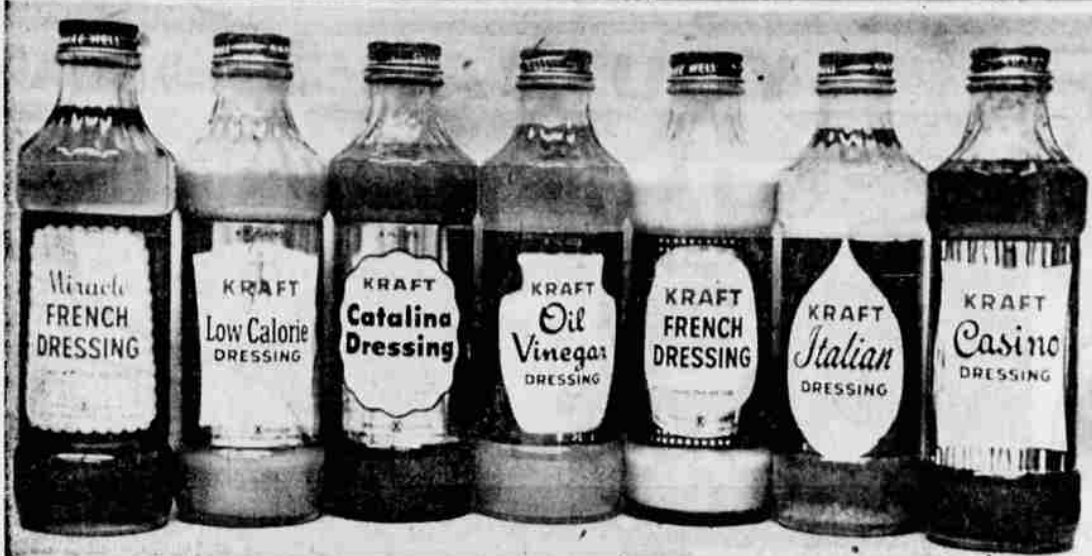
NEW LABELS and wide variety sparks the line of Kraft Foods salad dressings. Bob Van Laningham, Kraft sales representative, brought in the line-up shown here and the pic-