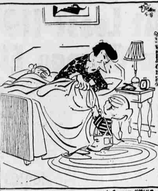
"NO, WE'RE NOT GOING TO 'SLEEP ALL DAY'. BUT WE WOULD LIKE TO STAY HERE UNTIL SIX-THIRTY!"