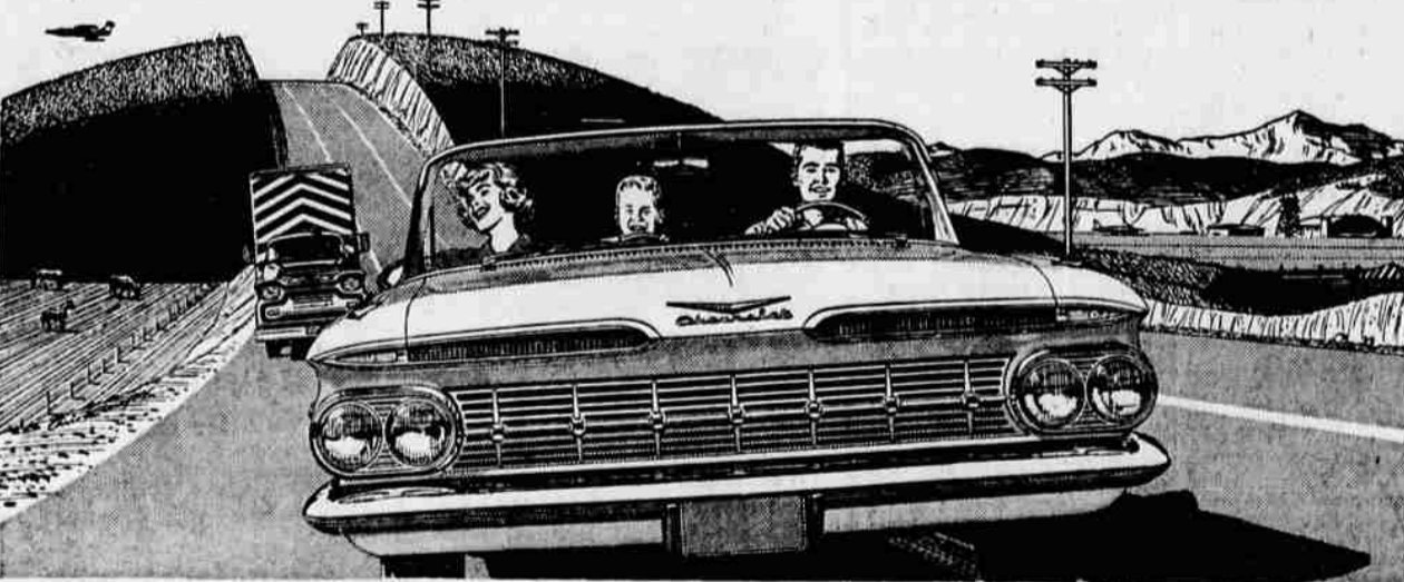
A V8-powered Impala Convertible... unmistakably '59!