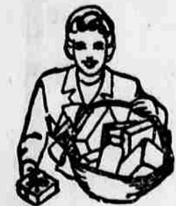
Cole of California

SINGER RECOVERS HOLLYWOOD (AP)—Anna Maria Alberghetti is recovering from a minor operation to correct a nasal obstruction that hindered her breathing. A hospital spokesman said her condition is good and the 22-year-old Italian-born singer will be home within two or three days.