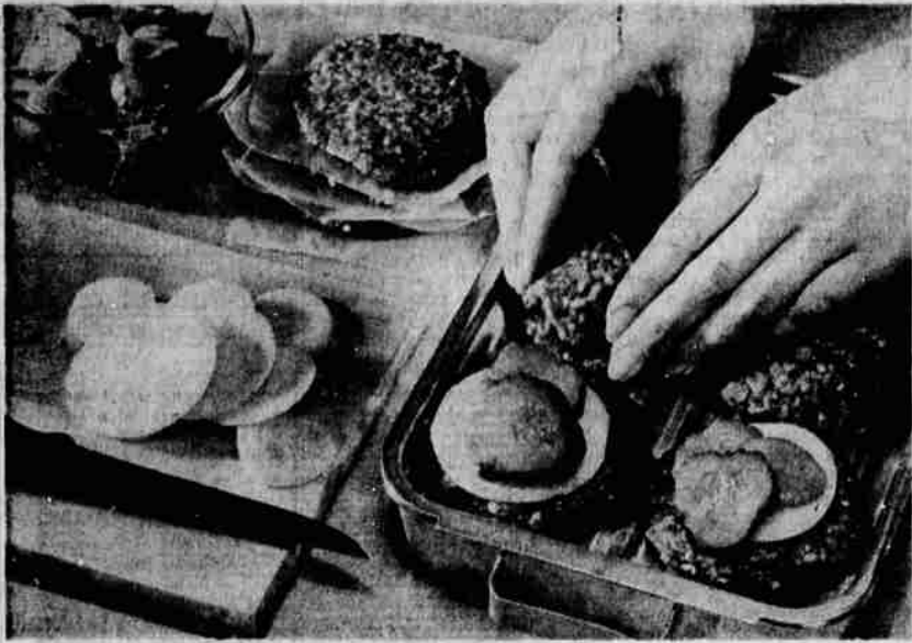
A DOUBLE BURGER holds a taste-treasure of pickles and onions. The meat patties are sealed together with the pickle slices and onion rings in between. Take your choice of pickles for the filling because you may be sure that the Klamath Falls markets have any type you prefer. You'll see a lot of pickles around because National Pickle Week is coming up right soon now.