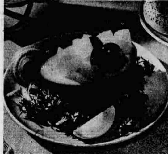
SALAD SOPHISTICATE is what California Foods Research Institute calls this halved Calavo avocado filled with small chunks of pineapple crowned with bright maraschino cherries. Serve with a good cheese-French dressing such as Wish-Bone or Nalley's.