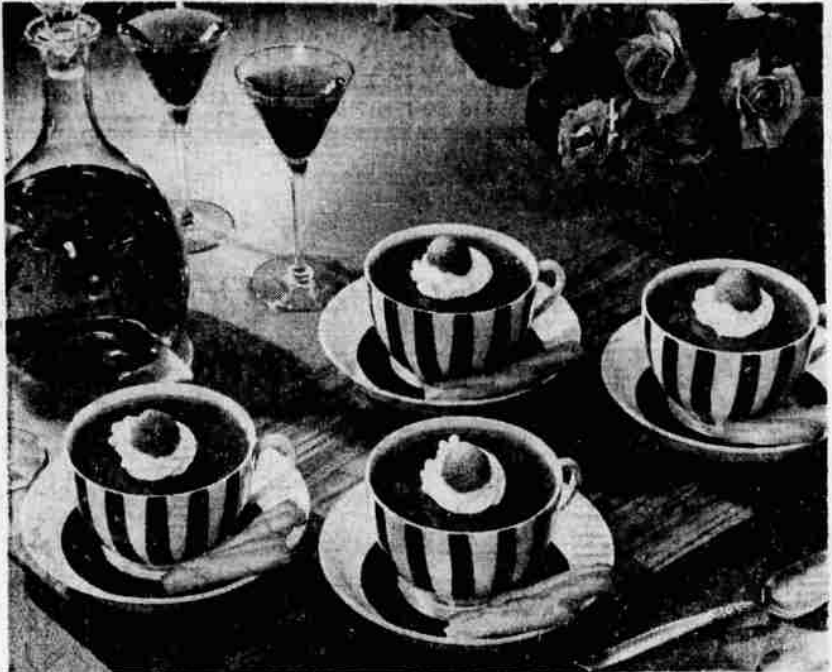
A CONVERSATION PIECE for spring parties is Martha's Teacup Dessert, a delightful gelatin dessert made with fresh rhubarb, fresh strawberries and California rose wine. The cups and saucers shown are from Gump's in San Francisco and the photo and recipe from California Food Research Institute.