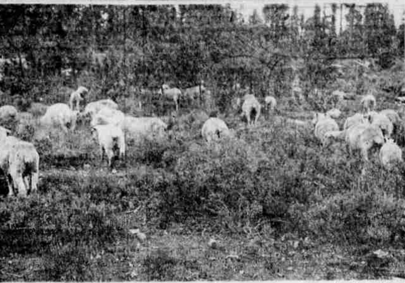
THESE SHEEP are among those grazing under Forest Service permit on the Rogue River Forest, another of the many activities on our national forests.