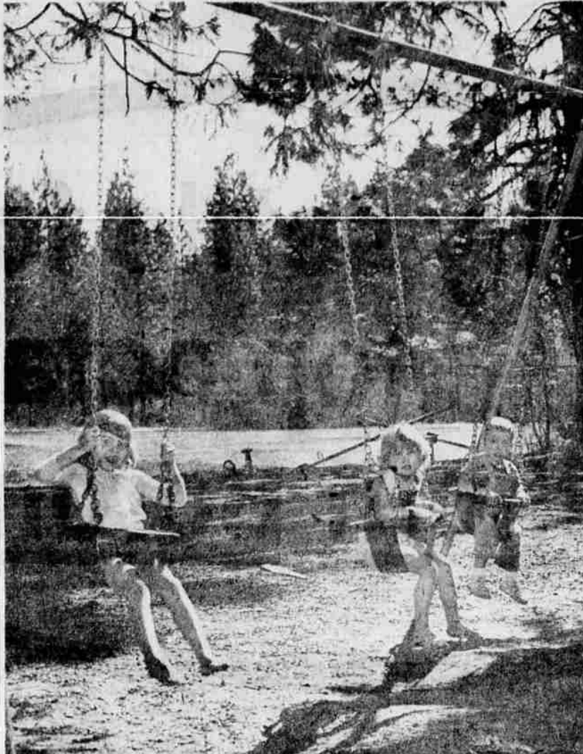
UNIDENTIFIED YOUNGSTERS enjoy the ever popular swings in the Mount Shasta city park. The swings are of the extra safe type and can handle the tiniest toddlers. Donated labor has turned the almost abandoned area into a well used, popular playground.