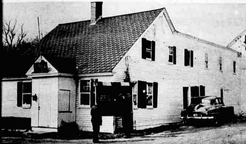
Rambling editorial and business office of Old Farmer's Almanac includes bulletin board (left) for weather and community notices.