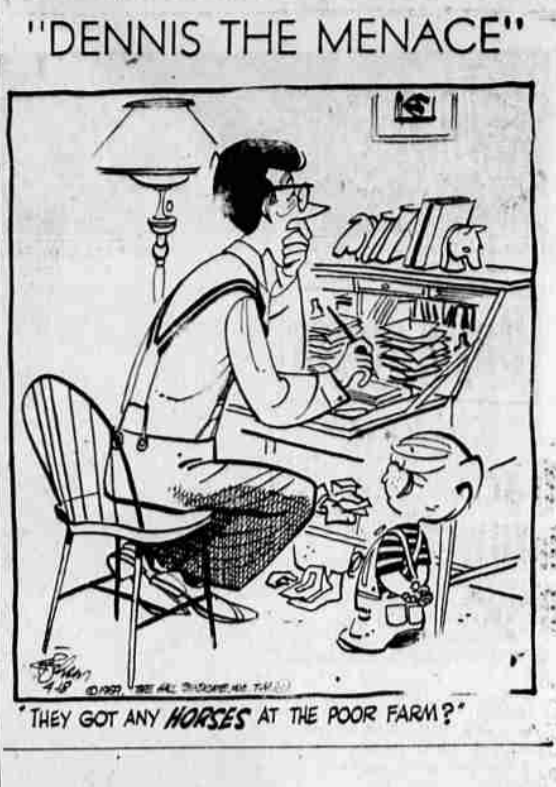
"THEY GOT ANY HORSES AT THE POOR FARM?"