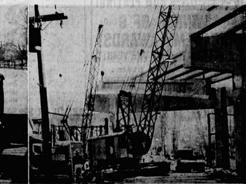
partment is clearly shown. There is telephone contact between front and rear units, and driving efforts have to be coordinated. It is estimated that the trip from Portland to Klamath Falls takes about 11 hours. Far right, a huge crane