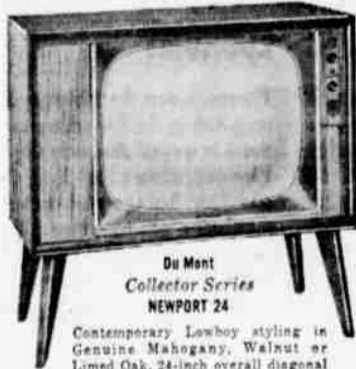
DuMont Collector Series NEWPORT 24

Contemporary Lowboy styling in Genuine Mahogany, Walnut or Lined Oak. 24-inch overall diagonal aluminumized picture tube. W-33 1/2", D-17 1/4", H-21" (22" with legs).