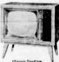
DuMont Collector Series BISCAYNE 21

Contemporary Lowboy styling in Genuine Lined Oak. 21-inch overall diagonal aluminumized picture tube. W-31", D-17 1/4", H-22" (22" with legs).