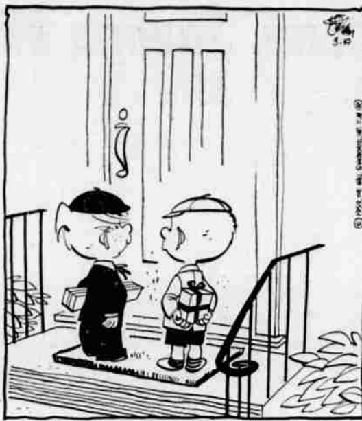
"I BROUGHT A CANDLE FOR HER CAKE, A ROMAN KIND...."