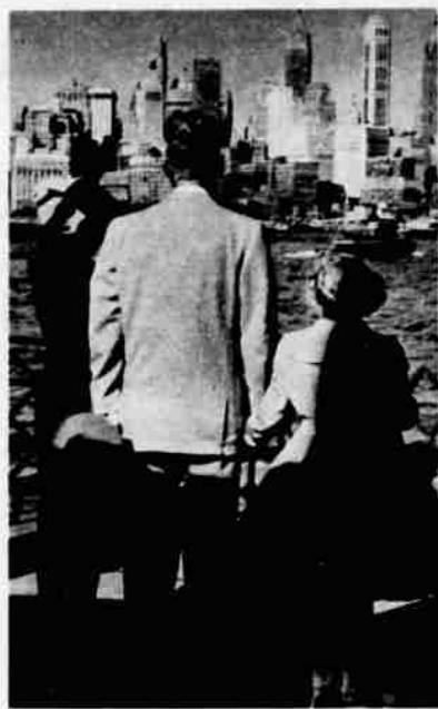
A breath-taking view of Manhattan skyline.

YOU SAY A NICKEL won't buy anything anymore? Tell it to a New Yorker, or anyone who has visited New York. There, the "biggest nickel's worth in the world," for the 54th straight year, is still a nickel—a trip on the Staten Island Ferry.