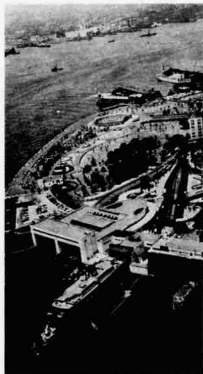
All day and night the ferries shuttle from Staten Island to docks next to the Battery.

For more than 50 years, commuters and visitors to New York have been riding the Staten Island Ferry for the same low fare.