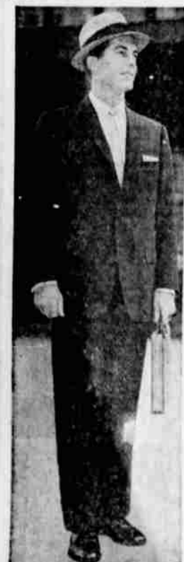
SUCCESS-STYLED is this three-button, natural shoulder suit with flap pockets, center vent and notched lapels. In Eastman Model — it has a luxurious look and stays fresh with a minimum of care.

"Snappy" dresser, middle of the road or conservative, no matter what a man's taste, he'll find a style to please him this spring. The slim unfitted Ivy look of past seasons is still being shown. The dresser, three-button "American Ambassador" model is also a consistent best seller. BUT, the very newest and most important style in the men's fashion world is the "Italian Continental!" The Italian Continental is a welcome change for those men who like to dress with verve. It is debonair — more sophisticated and worldly looking! The Continental has a two-button cutaway jacket, is slightly shorter, more rounded in front, with a slight indentation at the waist. The shoulders are conservatively accentuated. Shawl collars, peak lapels, side vents, slanted flap pockets and slimmer trousers complete the picture. With the Continental, a gentleman may wear his classic felt hat but derbies are destined for a new popularity.