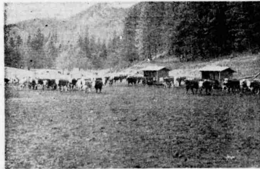
THIS BUNCH OF SHORT YEARLINGS were pictured in a field where they are being fed concentrates to speed gain. The mountain meadow is typical of the country around Fort Jones.