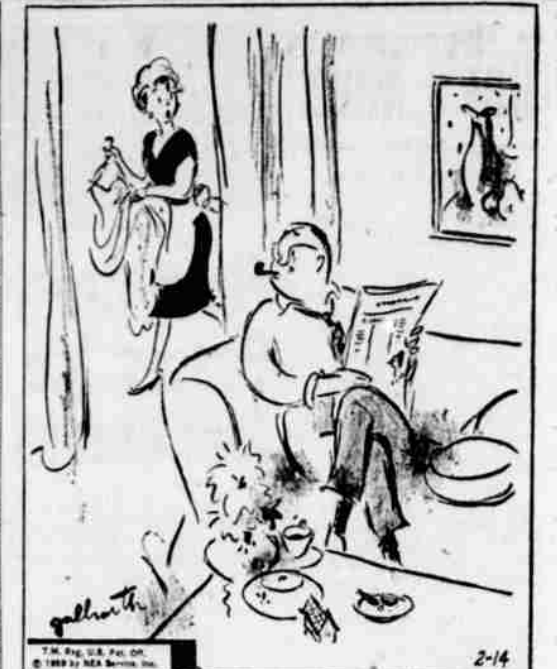
"I think you'd better put on your dinner jacket for the Fullertons' party. She's using my face tablecloth!"