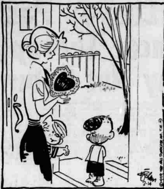
"SEE? I TOLD YA JOEY WAS STUCK ON YA!"