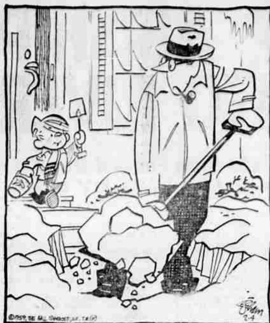
CHEER UP, DAD! I'M GONNA HELP YA!