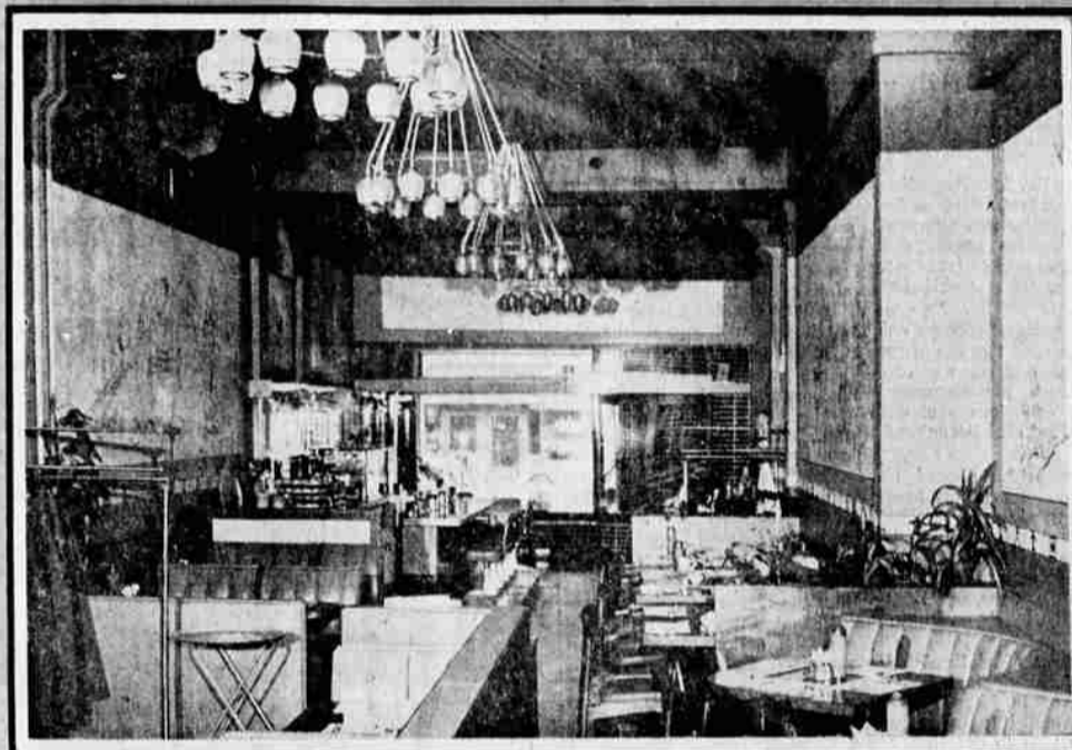
YOUR NEW WI-NE-MA COFFEE SHOP Come as you are • Families Welcomed • Special Childrens Menu and Souvenirs

Another Step Forward To Better Serve The Klamath Basin