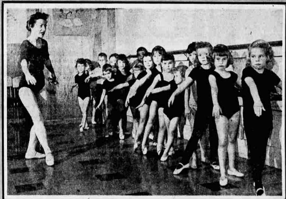
on the lower level of the WI-NE-MA hotel THURSTON'S DANCE STUDIO

Another Step Forward To Better Serve The Klamath Basin