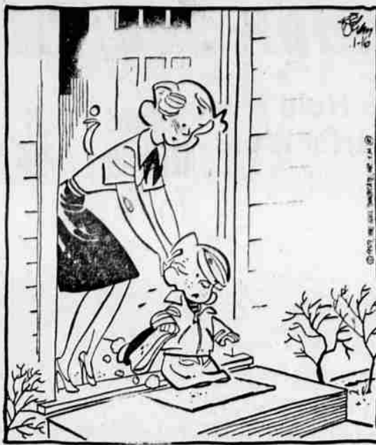
YOU TELL ME TO GO OUT... MR. WILSON TELLS ME TO GO IN... YOU TELL ME TO GO OUT... MR. WILSON TELLS...