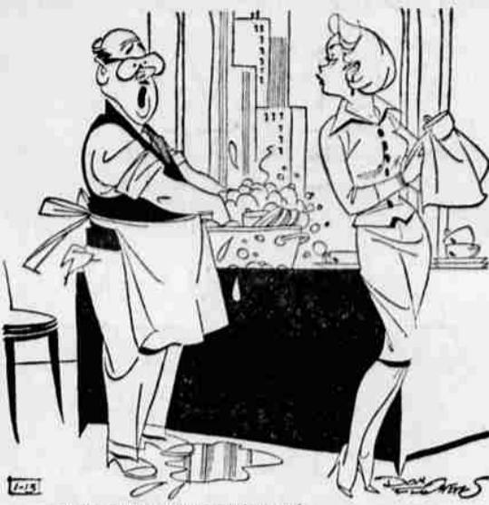
"Other firms' employees take their coffee breaks in paper cups!"