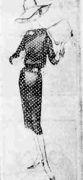
YOUNG VIEWPOINT, New York, gathers comas to make a fashion point and adds a new look to Spring's favorite dot. The silk linen blouson comes in black, navy, French blue or Ming green - all with a frosting of white pique. It is style 196.

GRANDMA'S COOKIES Home Quality! In good taste for every occasion!