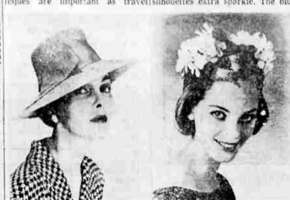
LILLY DACHE presents the elegant wide-brimmed cloche of tan pebble weave linen straw at left. It is accented with a giant tan faille band. The high-styled crown, unusually tall, perfectly exemplifies the upward look for spring. The silhouette has a smart profile tilt. At right, Miss Mary fashions an oriental with geranium maple leaf coil. It fits gently on the back of the head, the geranium leaves just touching the coiffure.

Previews of trends in millinery scene. Silhouettes with open crowns, allowing the hair to show, seem an avant garde trend to watch. Fabrics are put to good use from airy, light organzies and delicate hairbraids to texture checks, straw cloth and novelty braids. Both textured and smooth straws are evident in the collection, with the latter predominating - balubunal, bako-soies, toyes, panamalacs and the like. Bloused berets and softly draped toques are important as travel hats, as well as for the street scene. Clear colors this spring give hat silhouettes extra sparkle. The blue spectrum from the palest to royal enhances the color scene. Hues of sun yellow, peridot (a green-yellow), cherry fizz (a vibrant pink), brighten the color horizon. A "near-white" is the new neutral for spring, along with beige to mocha tones and white and black completing the plan. Many hats sit just back of the hairline, some with a decided profile tilt, and almost without exception the hair shows.