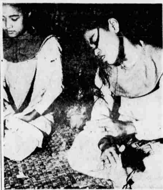
Scene From "A Cry In The Night"

They said the students agreed to pay $300, the estimated damage at the Delta Gamma sorority house.