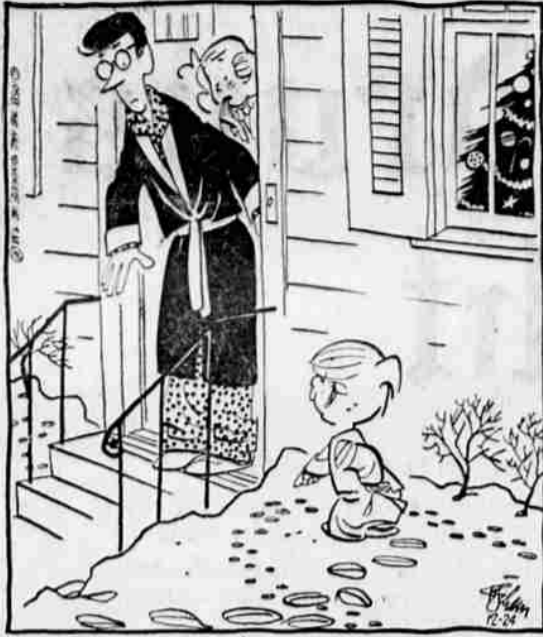
"LOOK! RIGHT THERE! AREN'T THOSE REINDEER TRACKS?"